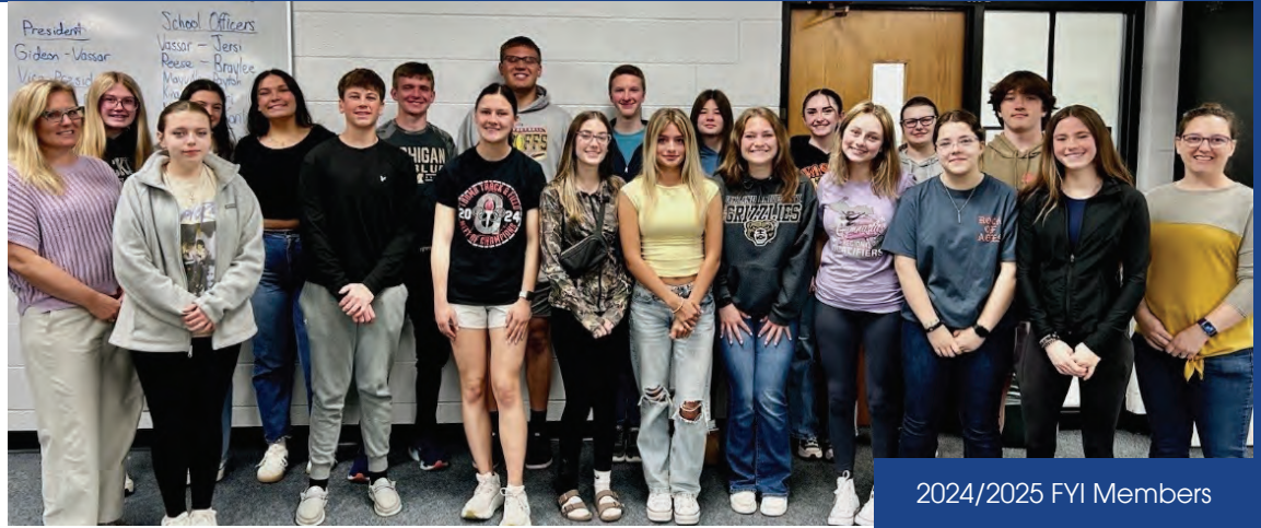
2024/2025 FYI Members